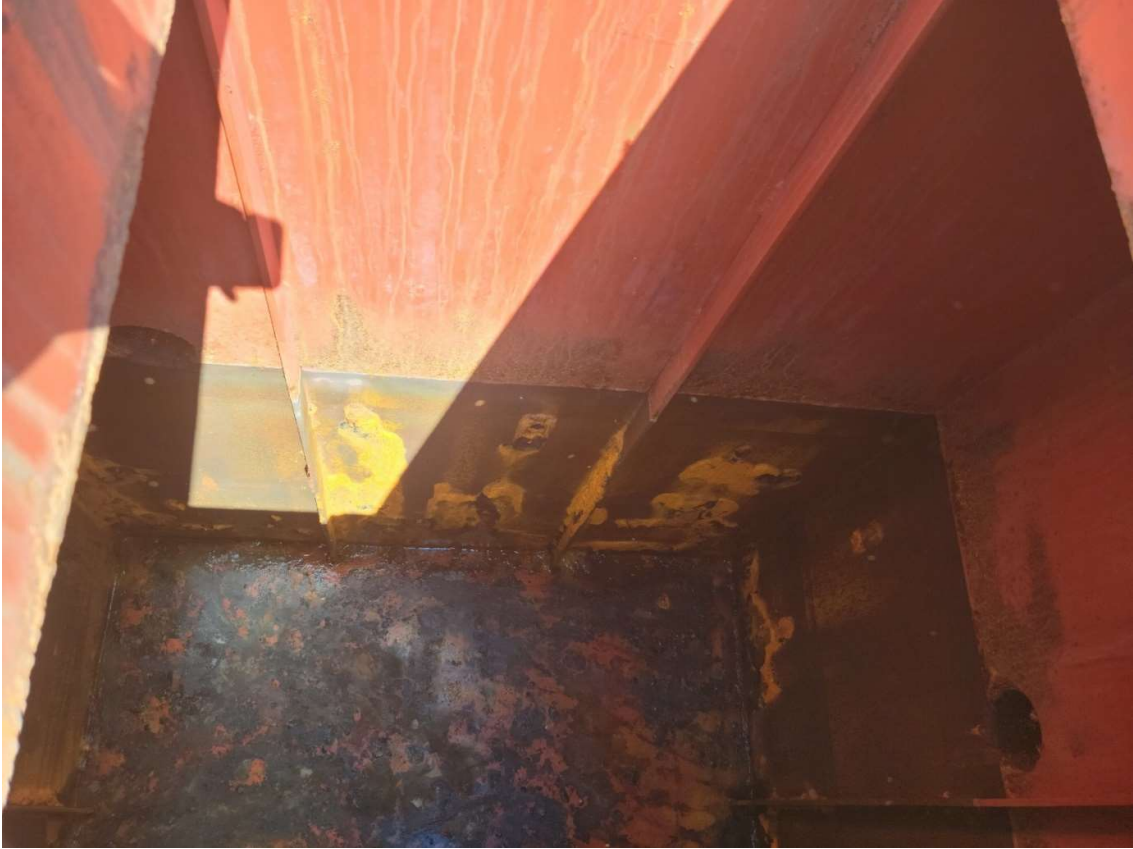
Vault Pumped Out