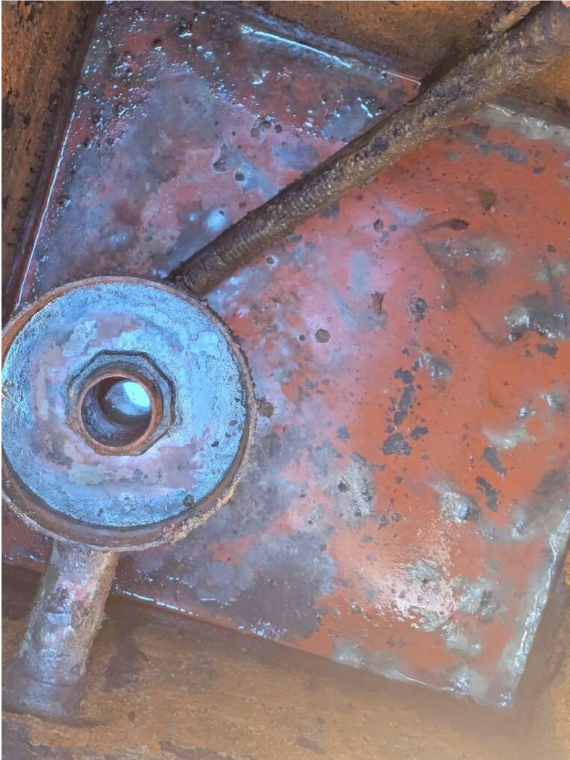
Vault Being pumped out