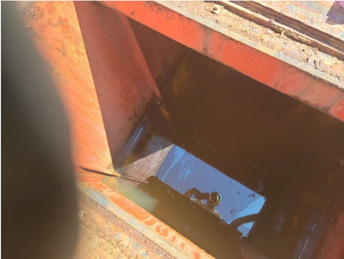
Vault, Pre Pump Out