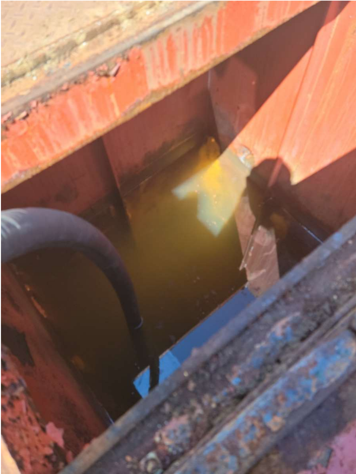
Vault, Pre Pump Out