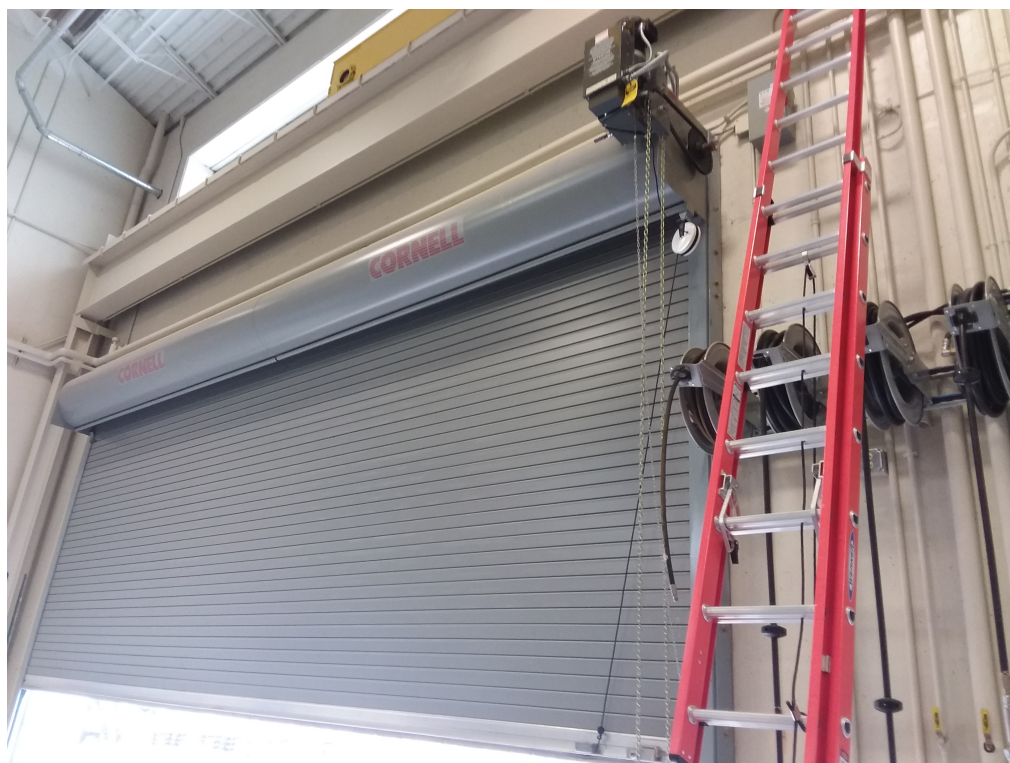
new cord reel