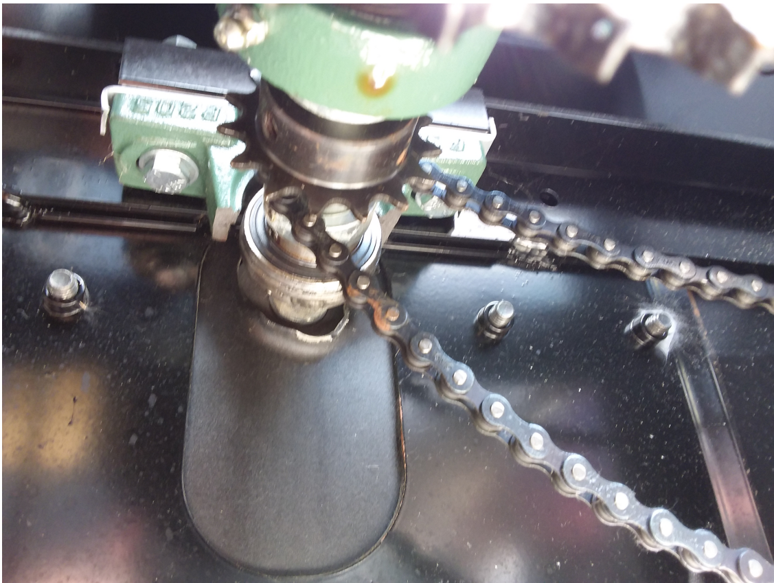
old broken pillow block bearing