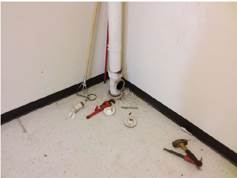
clean out 1st floor before