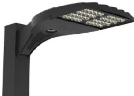
Image is an illustration, may not reflect the exact product sold.

MFR SKU: DSX0 LED P5 50K T3M MVOLT RPA DDBXD