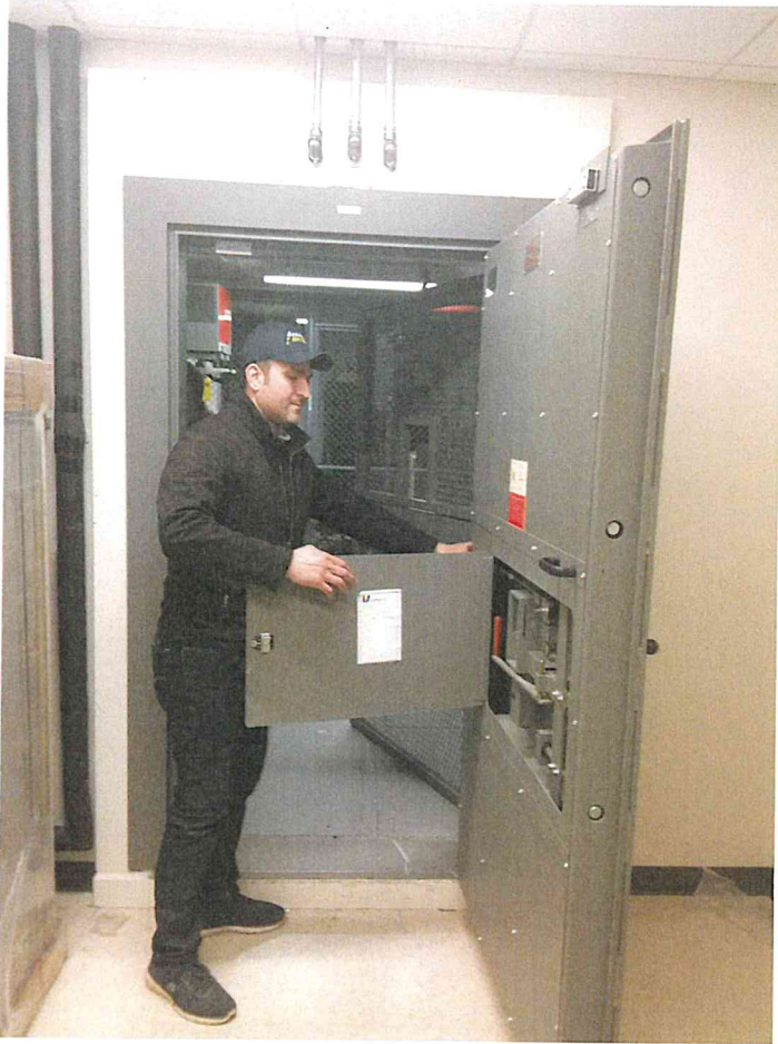
B-2 Vault 1