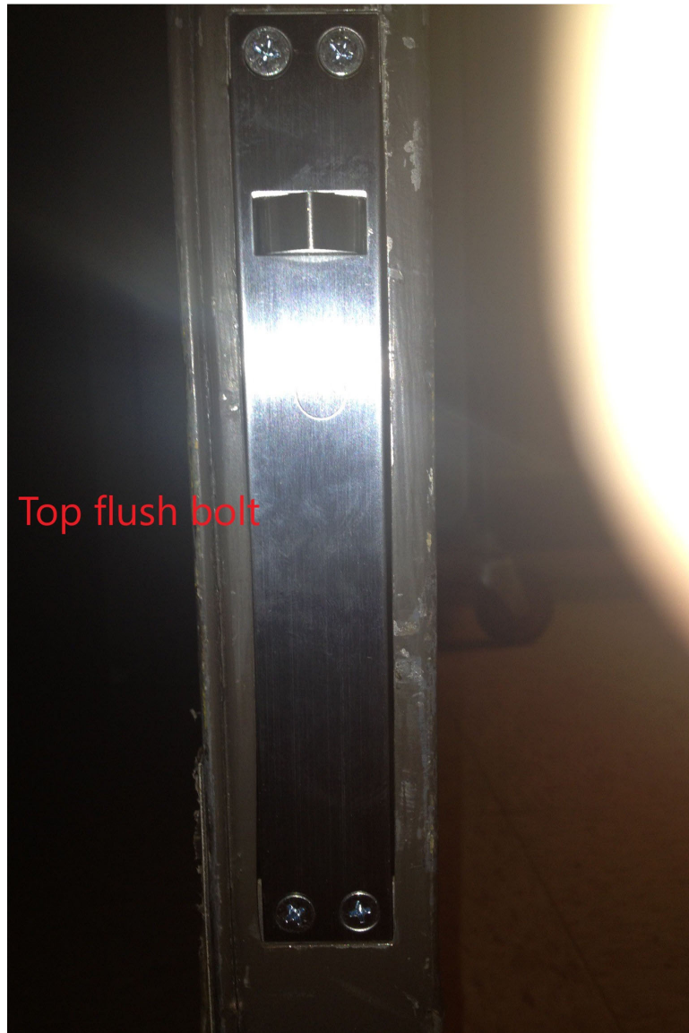
Top flush bolt