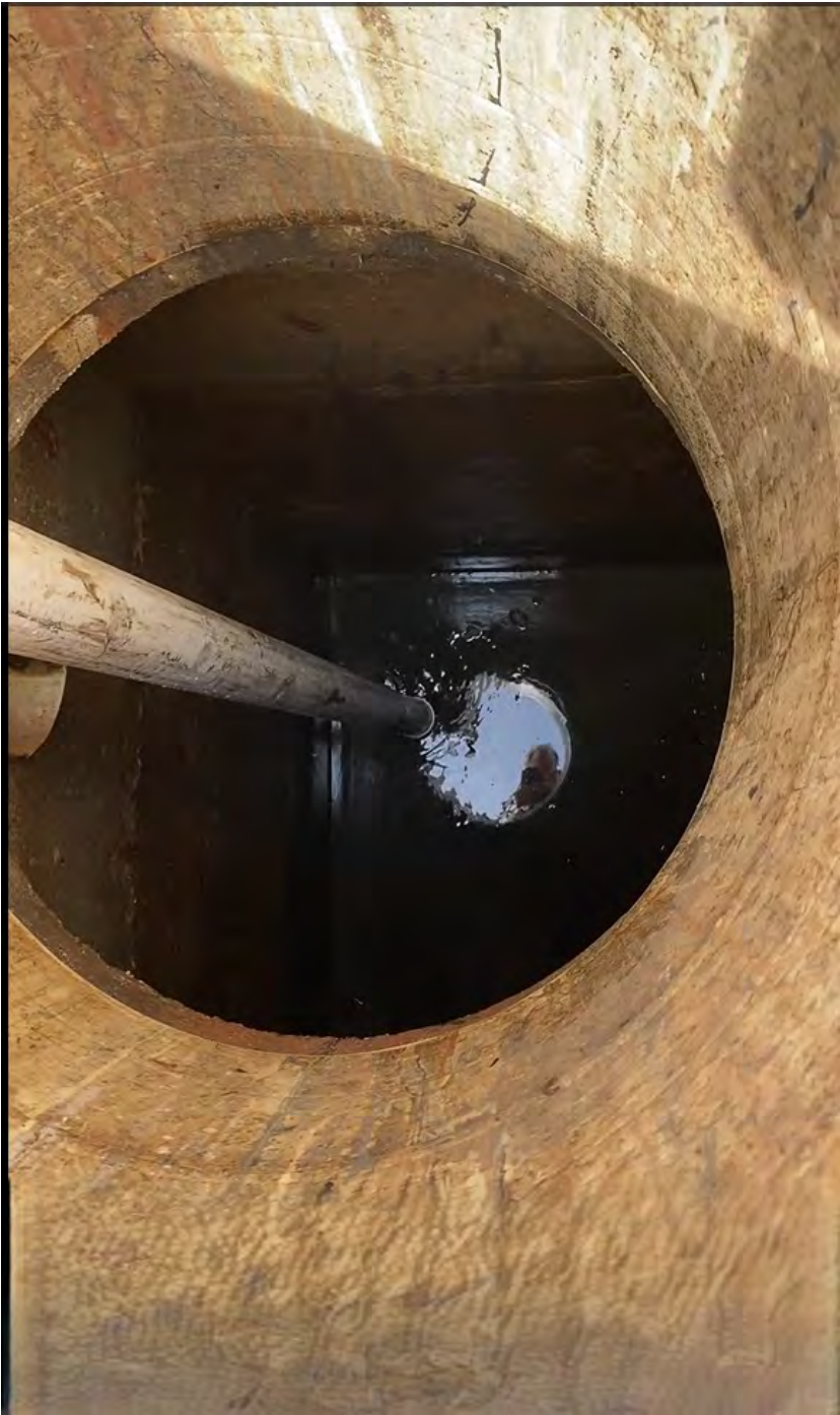
Septic Tank Evacuation