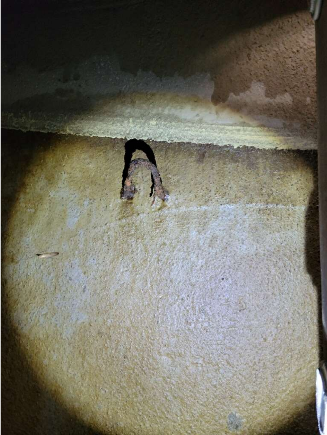
First Vault - Wall