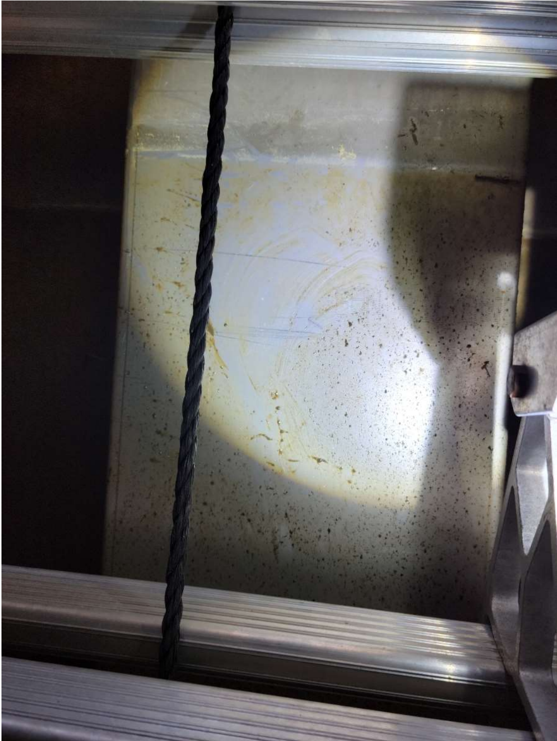
Third Vault – Wall