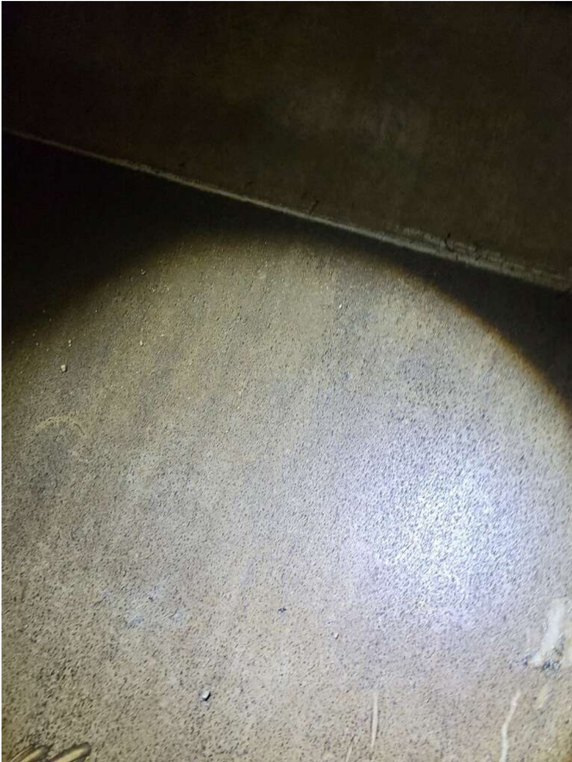
Second Vault – Floor