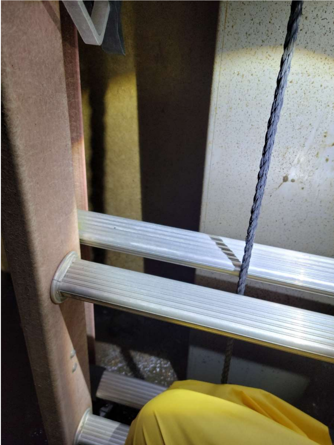
First Vault – Wall