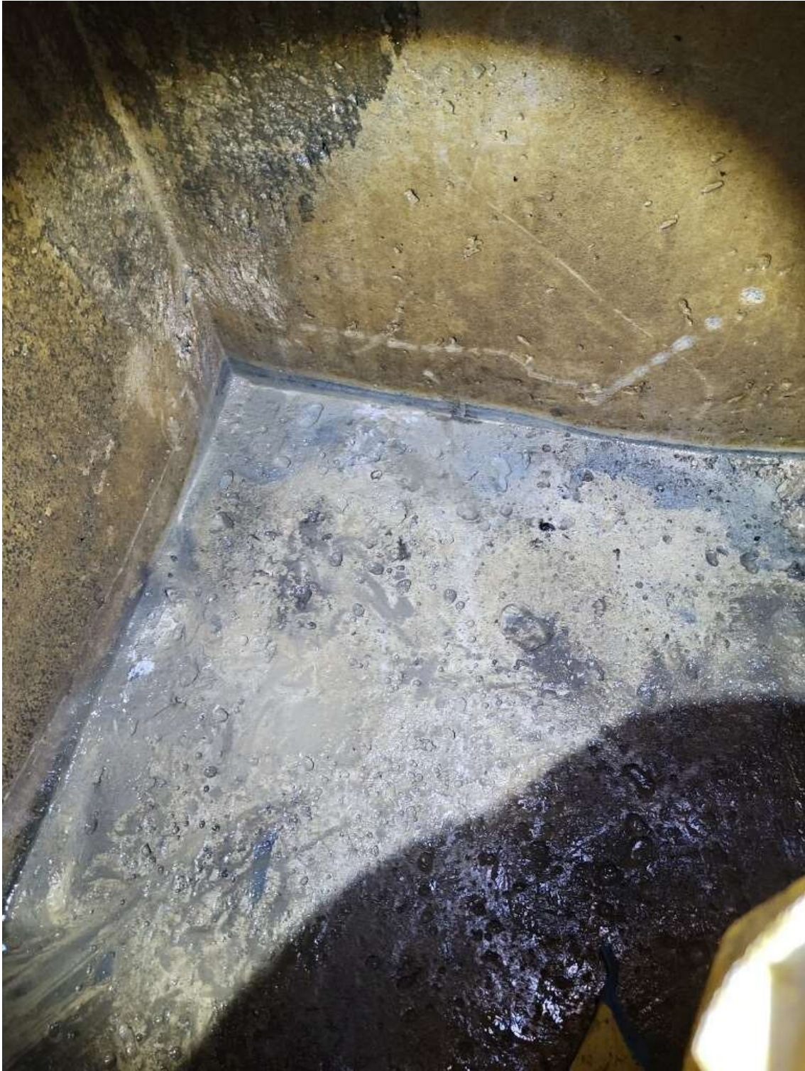
First Vault - Floor