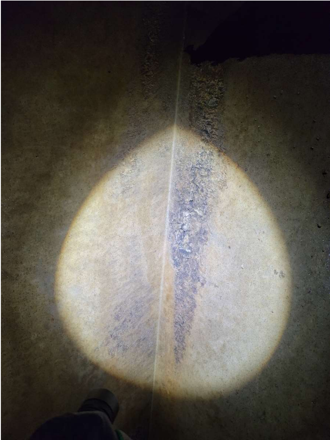
Second Vault – Wall