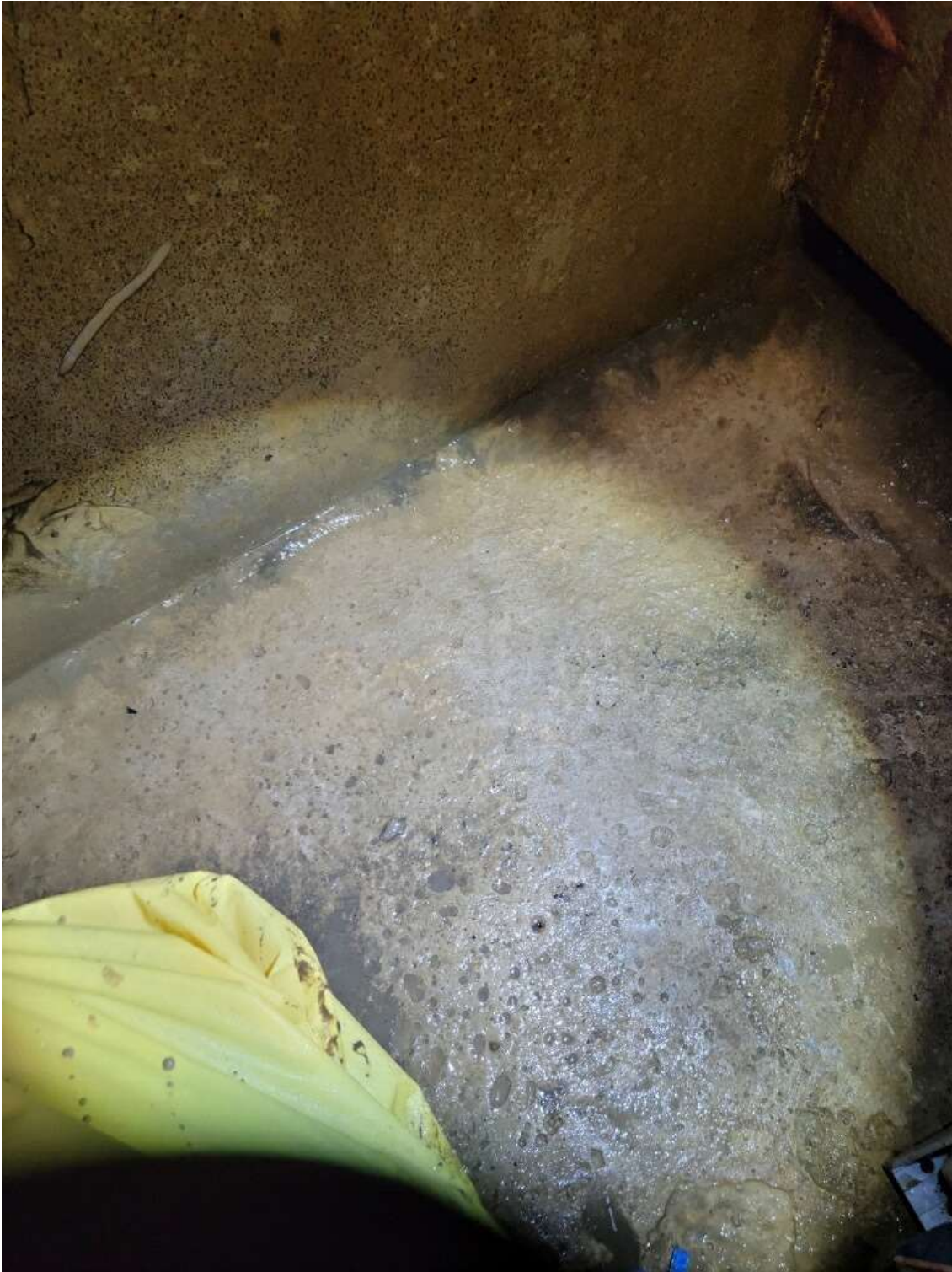
Third Vault – Floor