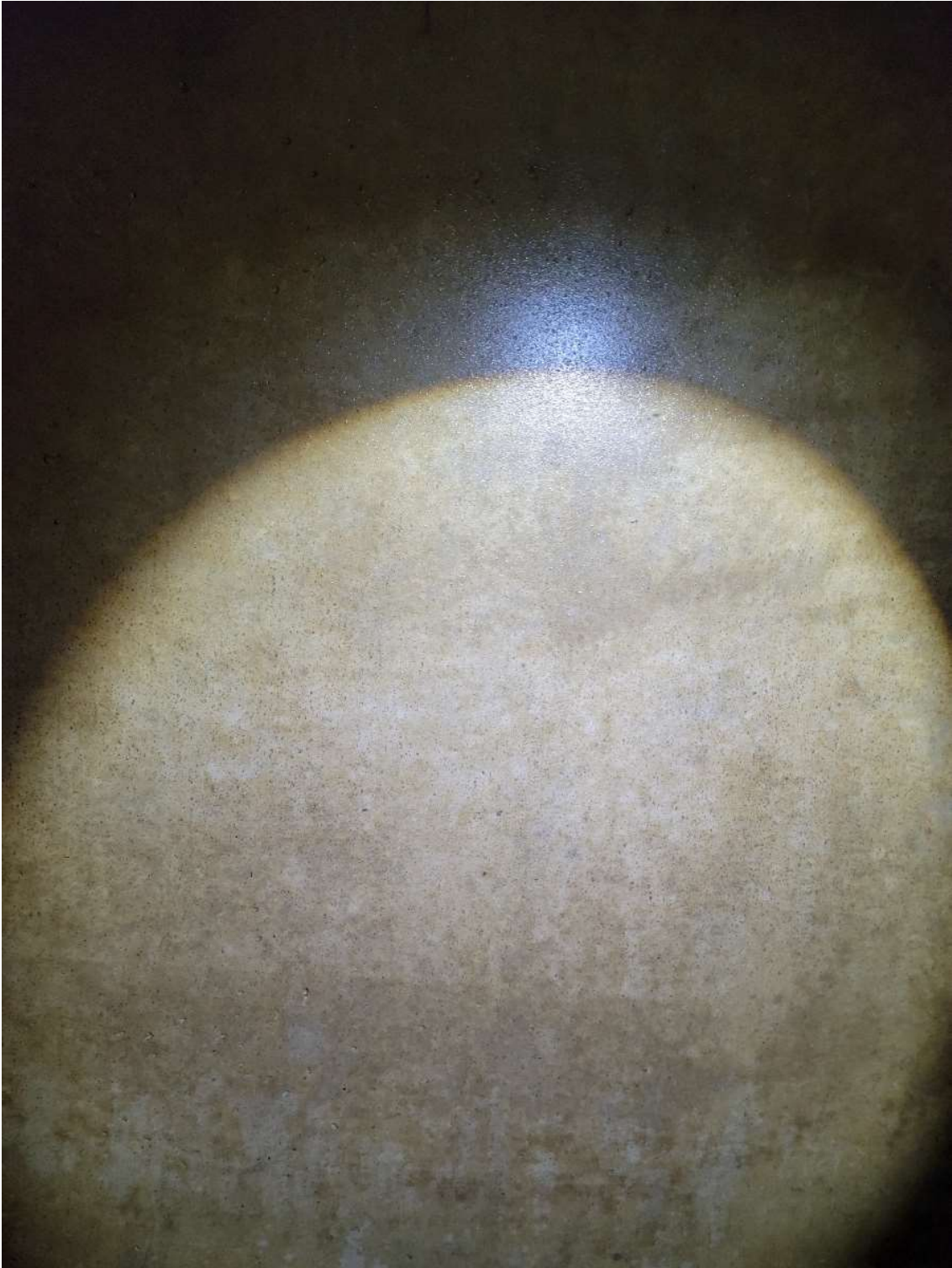
Third Vault – Wall