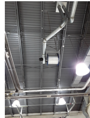
# 5 Bay