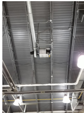
# 2 Bay